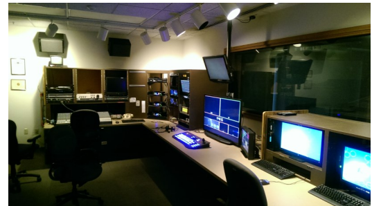
IOCI TV Control Room

Our new electronic magazine format allows us to integrate video, quizzes, polls, e-mail, web links and more. The goal of this interactivity is to increase agency involvement and Pilot Agency implementation transparency by pulling back the curtain on the implementation process and building statewide operational confidence.