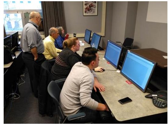
Participants executing UAT scripts with support from the State team