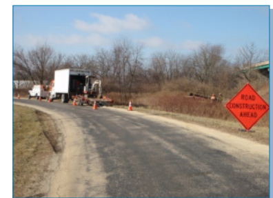
Meade begins work near Kankakee

A printable version of our construction package list and fiber map can be found on page two of this update. We hope the weather continues to cooperate through the Spring to keep our construction crews on schedule. We thank you for your continued interest and support.