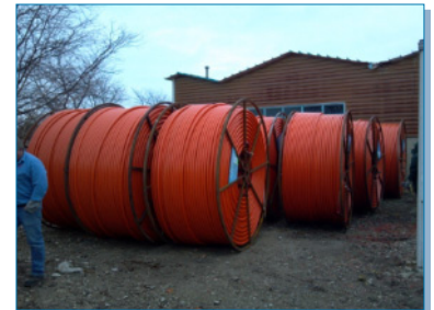
Miles of conduit ready for installation