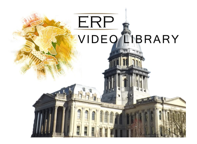
Click on the Capital to see archived videos online!

Carol Radwine (CFO, I-EPA) added "Clean up your receivables! The cleaner you can get your accounts before you get to this phase, the better off you'll be."