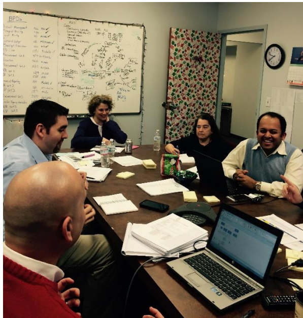
EPA BPD review war room in progress

BPDs are one of the blueprints to the ERP system. They define business processes with activities mapped to SAP transactions, which will then be used to configure and develop the system.