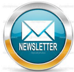
Click above for the Newsletter Archive