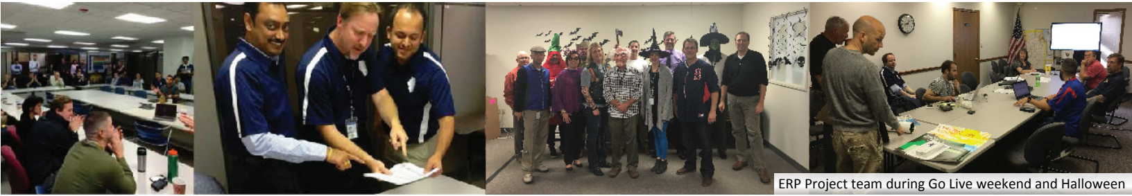
ERP Project team during Go Live weekend and Halloween

On Saturday, October 1, the IL ACTS ERP Program launched SAP in our 4 pilot agencies (IDES, EPA, DVA, and IOC) after months of tireless work from agency and State staff members to make it successful. We are proud to have achieved this milestone in our ERP program and want to thank every person who has contributed to the success so far for the dedication and commitment shown. This is a huge step forward for technology at the State and we want to congratulate everyone on this achievement.