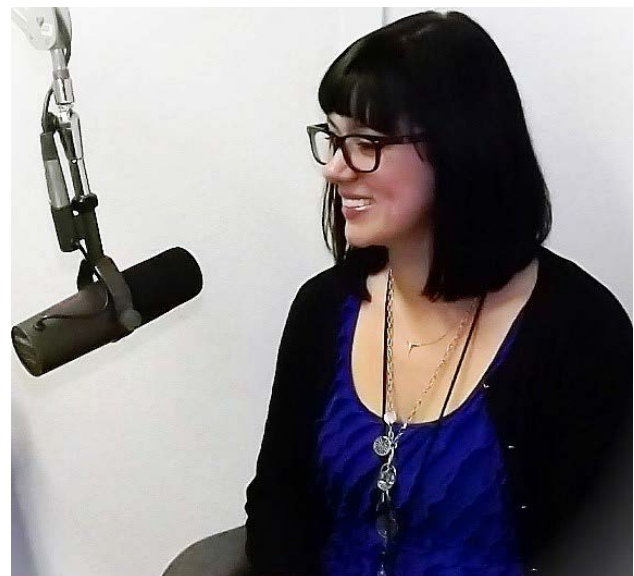
Click here for Tara Kessler's Master Data and Chart of Accounts program